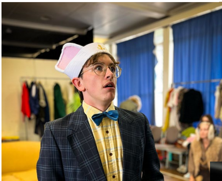
Photos from full Dress Rehearsal for Stuart Little. With thanks to Suzen Parnell.