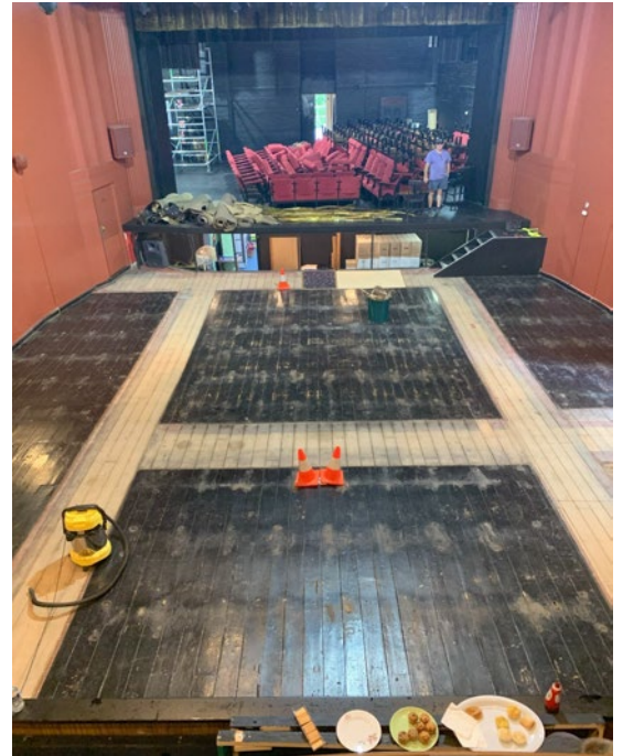
Before the renovations, and as the repair, sanding & staining of the Theatre floor took place.