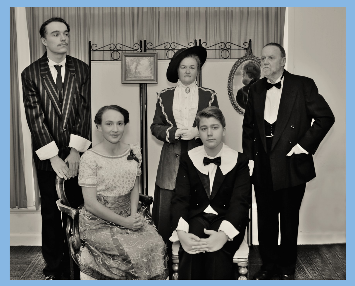
THEN AND NOW