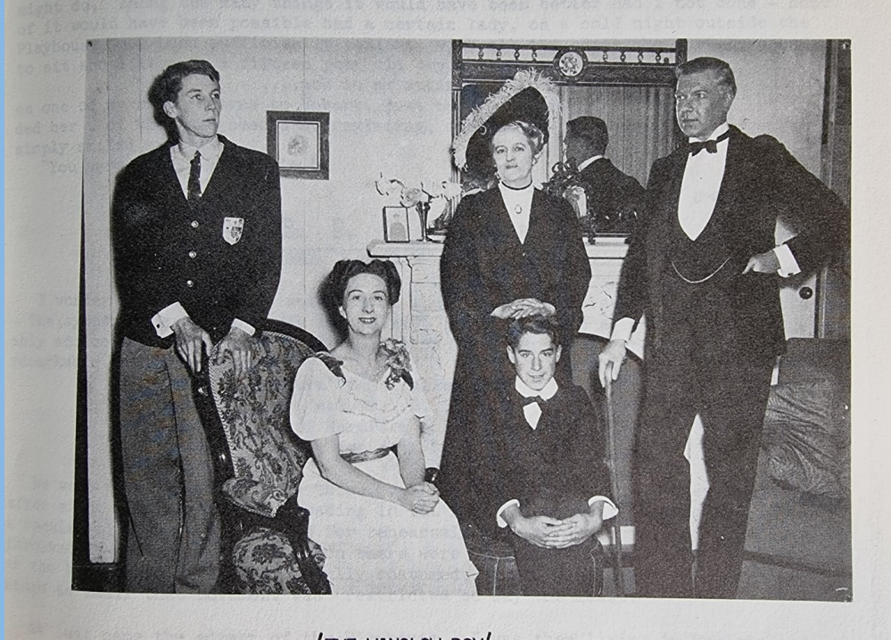
THE WINSLOW BOY'

Here is a photo of the original production and our attempt to recreate this shot.