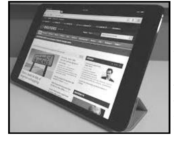
DIGITAL REPERTOIRE IS COMING! Yes it's the 21st Century and ,in time, the printed copy of the HRTS newsletter will be phased out. With so many people

using iPods, iPhones, tablets, phablets and laptops (etc) it will be an exciting way to keep you up to date more often-with links to our website and more. We will continue to print some for those with no access to the gadgets listed above but we think most people will embrace the new format. To enable this to happen we invite you to ensure we have your email address. If you have privacy concerns please let us know. Editor.